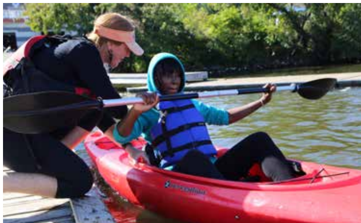
Spring 2016 brought more than 500 eighth-graders to the middle branch of the Patapsco for another successful season of the Kids in Kayaks program. Students learned a new skill (kayaking) while simultaneously learning about the history of their city and the Chesapeake environment. Capped off by a lesson in stewardship, this place-based experience has been called out as “the best field trip ever” by participating teachers and students.

Regional Office enabled the heritage area and its partners to hold a congregational town hall in March 2016. Facilitated by Partners for Sacred Spaces, the town hall brought together 80 people from religious institutions and the arts and cultural communities. Diminishing congregations and donations — as well as increased maintenance and capital costs — are placing a burden on many of the city’s historic religious structures. The town hall participants explored partnerships and brainstormed ways that sacred spaces can revitalize and capitalize on their historic structures and facilities.